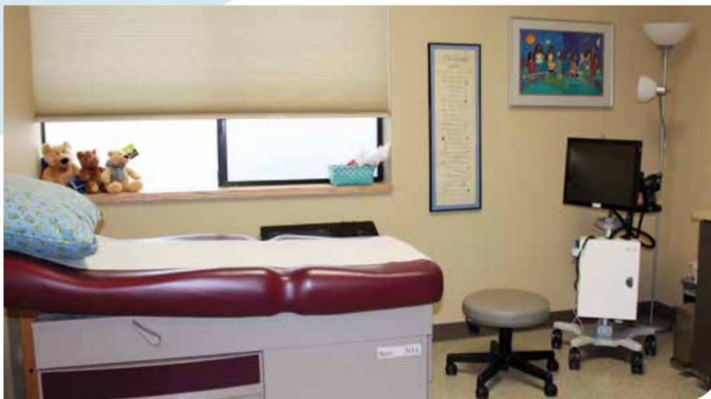
Liberty House exam room

Thank you, contributors, for your gifts enabling us to grant funds for this critical service for young boys and girls in Dallas! 🇺🇸