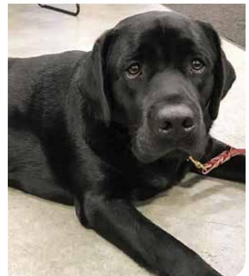
Liberty House support dog Eli