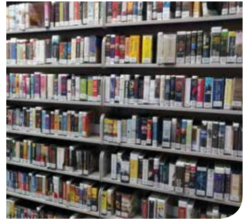
Foundation funds enable the library to keep the audio and large print book collection relevant and growing.

Over the past year, Dallas Library had 5949 checkouts of adult audio