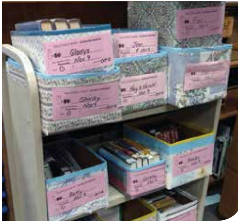
Books are ready for delivery to patrons who cannot physically come to the library.