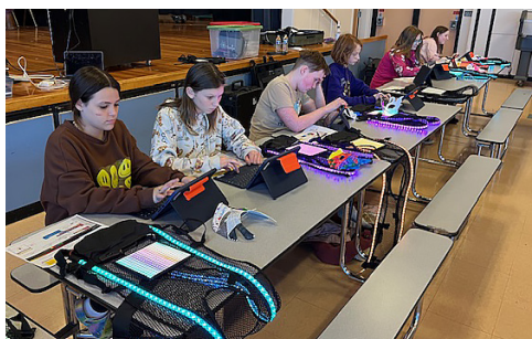
LaCreole students at the Code Can Dance STEM+Arts Workshop.

With support from a DCF grant, students at LaCreole experienced a new way of learning computer coding, incorporating lighted SmartVests and dance, weaving their creative superhero characters into a performance.